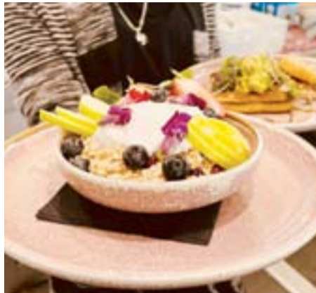
It is a case of what would you like to try next with the River Cruz range.

Being located close to the CBD, but also the well-designed paths along the Burnett River