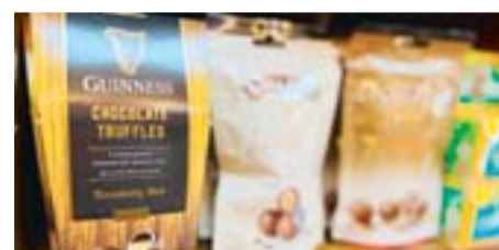
There are some chocolates that provide a little decadence this holiday season.