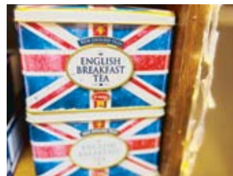
Union Jack tea tins make for an ideal gift as they can be used over and over again.

"We are still yet to receive our last shipment but I am certain we will sell out before Christmas."